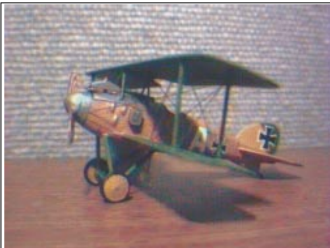
Allan Wright's W.W.I Albatros model