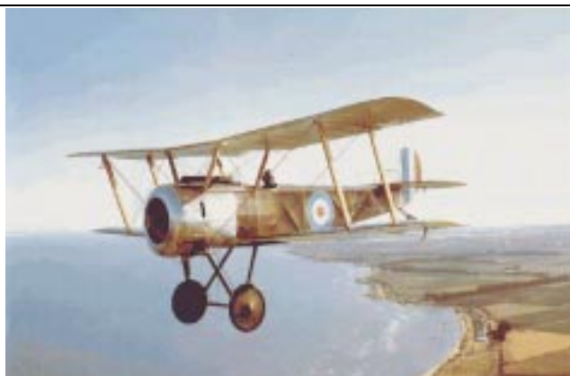
August's Featured Model — Sopwith Pup in flight from Allan Wright's W.W.I modeling Web page

maneuverability speed and rate of climb, and in August of 1917 it became the first plane to land on a moving ship, the HMS Furious.