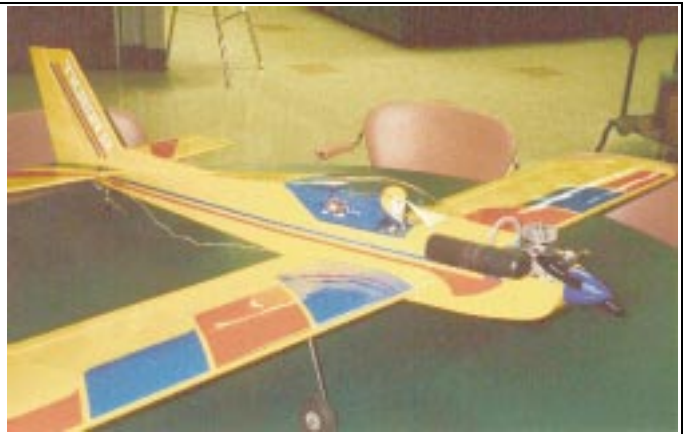
Rich Dean's Tiger 2 took second place in the sport category. It has a lot of coving details that make it stand out.