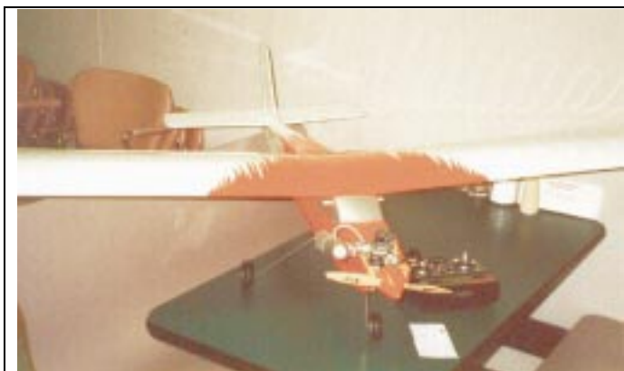
Dale Brech won second place in the trainer category with the new Eagle II club trainer. The jagged edges on the red covering give it a distinctive sporty look for a trainer.

Van Snyder's bright yellow LT-40 took first place in the trainer category. The black details really show up on the yellow background.