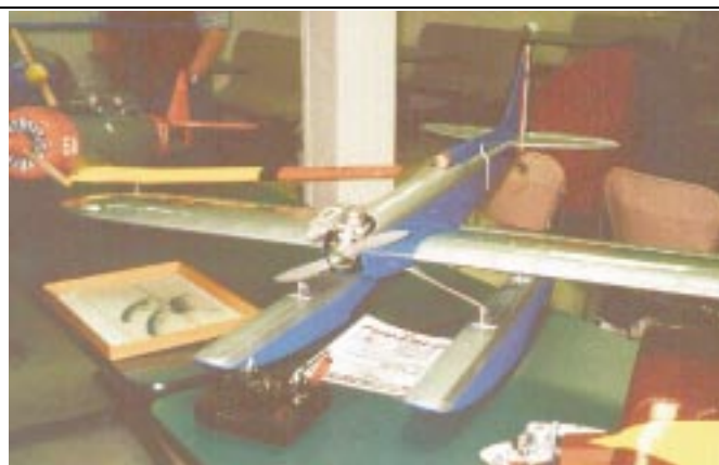
Geoff Barrance's Super Marine racer adapted form a Four Star 40 kit. He really did a nice job of converting the sport plane into a scale model.