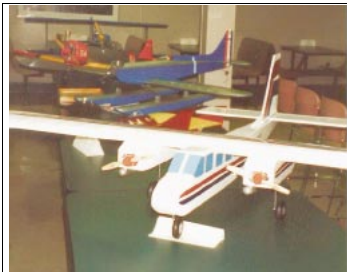
Rich Dean and Duane Smith received third in the scale category for their islander twin loosely based on an LT-40 kit.

Van Snyder's bright yellow LT-40 took first place in the trainer category. The black details really show up on the yellow background.