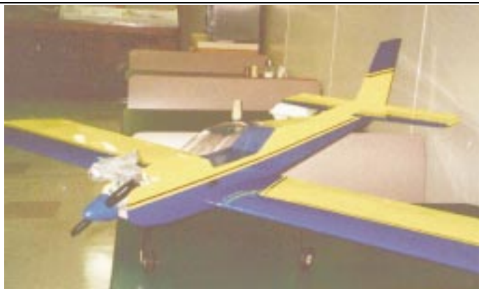
Dan Cooley's Tiger 60 won first in the Sport category. Dark blue and yellow covering give nice contrast and blue pin striping adds nice detail.

On April 2 nd we had our annual Model Beauty Contest. The planes were judged in three categories: Scale, Sport, and Trainer. There was an excellent turnout for the event and it was obvious that a lot of members had been working hard on their models this winter.