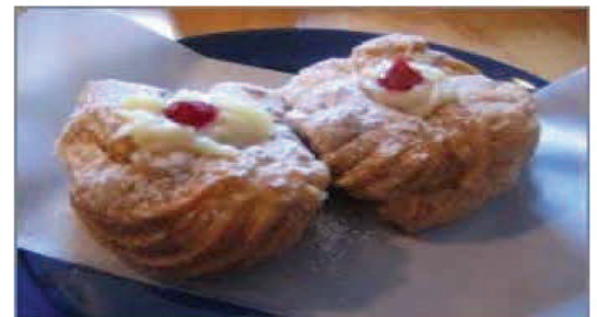
Zeppole, puff-pastry filled with ricotta cheese, vanilla cream or chocolate, is one of the most popular St. Joseph's Day treats. Look for them at Italian bakeries during the month of March.