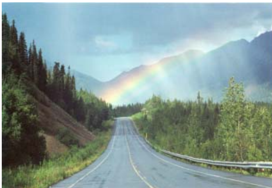
Alaskan Rainbow – David Detwiler 1 st Place Landscape - Color