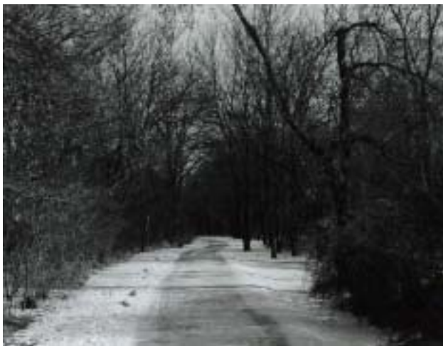
Winter Trail – Jim Zelle

The October meeting was a photo shoot held at Pinicon Ridge Park on a beautiful fall afternoon. We started out at the wildlife sanctuary photographing a small herd of elk that didn't appear too interested in all the people clicking away with their cameras. The elk were sitting in the shade under a tree, forcing a tricky shot with the subject in a shadow and the sun partially backlighting the scene.