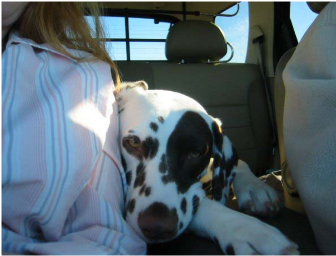
Can I Drive, Pleeeease?