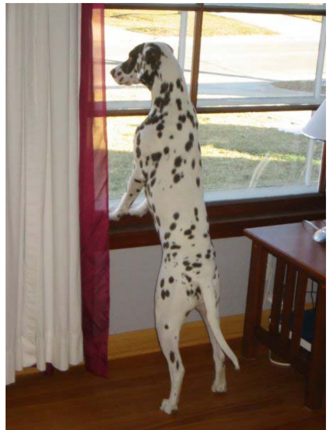
Are They Home Yet?

Know of any events in the Eastern Iowa area? Let me know!